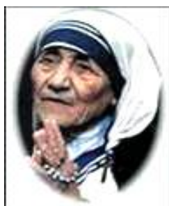
Blessed Teresa of Calcutta

Every time you smile at someone, it is an action of love, a gift to that person, a beautiful thing.