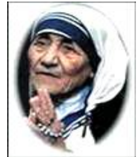
Blessed Teresa of Calcutta

"Humility is the mother of all virtues; purity, charity and obedience. It is in being humble that our love becomes real, devoted and ardent. If you are humble nothing will touch you, neither praise nor disgrace, because you know what you are. If you are blamed you will not be discouraged. If they call you a saint you will not put yourself on a pedestal."