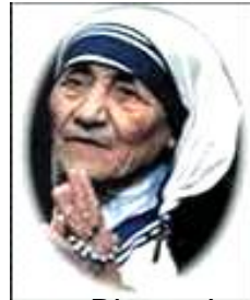
Blessed Teresa of Calcutta

If we pray, we will believe. If we believe, we will love. If we love, we will serve.