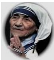
Blessed Teresa of Calcutta

Look at the tabernacle – see how much this love means now. Do I know that? Is my heart so clean that I can see Jesus there?