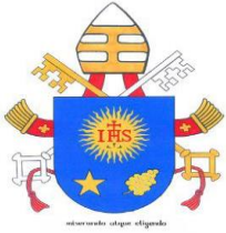
Pope Francis Rome, Italy