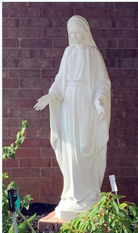
at Our Lady of the Lake