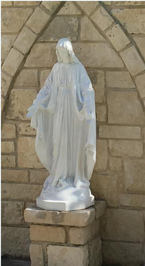
at St. Charles Borromeo