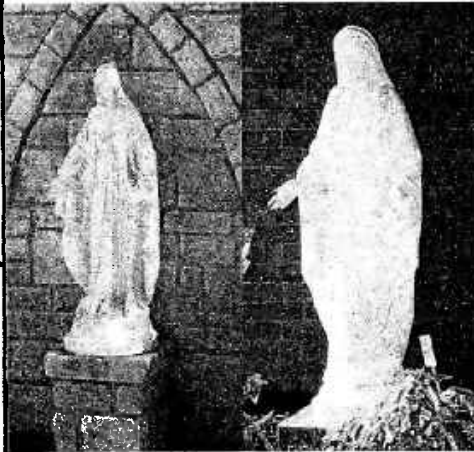
at St. Charles