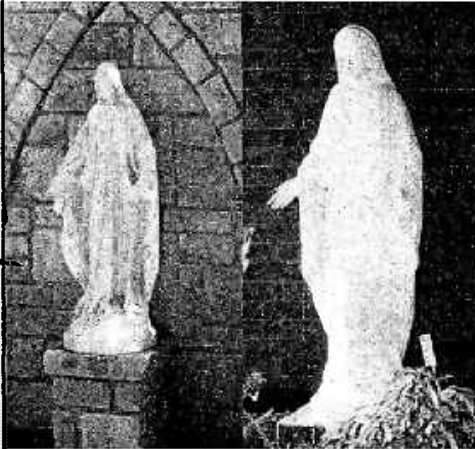
at St. Charles