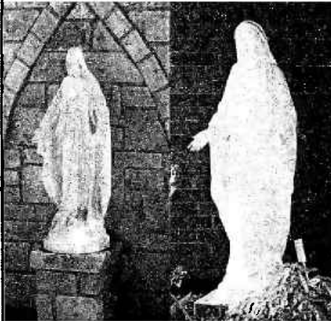
at St. Charles