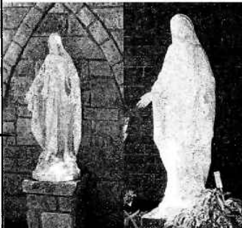
at St. Charles