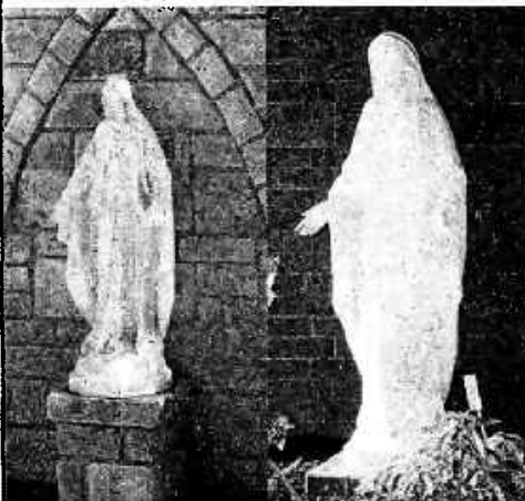
at St. Charles